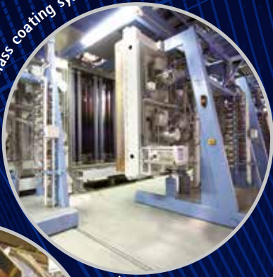
Web and Glass coating systems